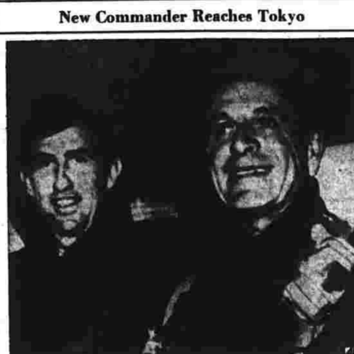
Gen. Douglas MacArthur, who was invited to testify before the Senate Armed Services Committee as part of a broad-scale review into the policies that led to his firing.

Washington, April 13—(AP)—The Air Force announced today that five U. S. B-29 Superfortresses were shot down in a jet scramble near the Yalu river yesterday. The announcement was made after an air force briefing officer disclosed the loss of two of the big bombers in an air battle with Red jets near the Yalu river yesterday. Three additional B-29s have been lost to enemy air action in prior engagements, it was announced. One of the three earlier losses, the Air Force said, was from ground fire. No details were given, but presumably they were recent losses.